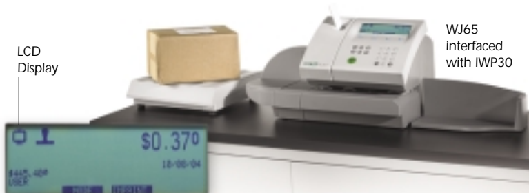
WJ65 interfaced with IWP30

Depth: 9 1/2" Height: 6 5/8" Width: 4 3/4"